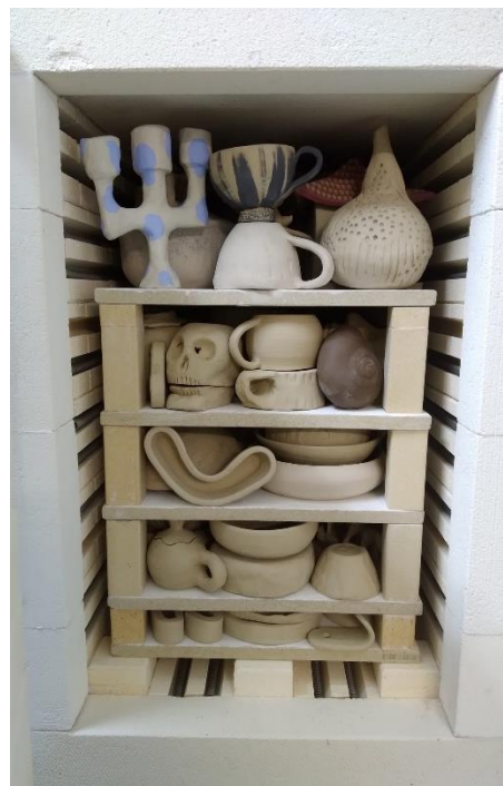
The new kiln fully loaded