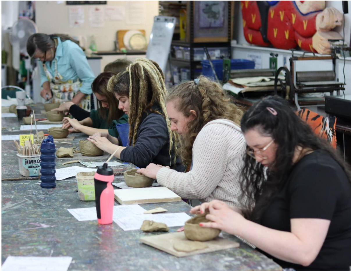
Artists attending the 'Hand Built Teapots' class