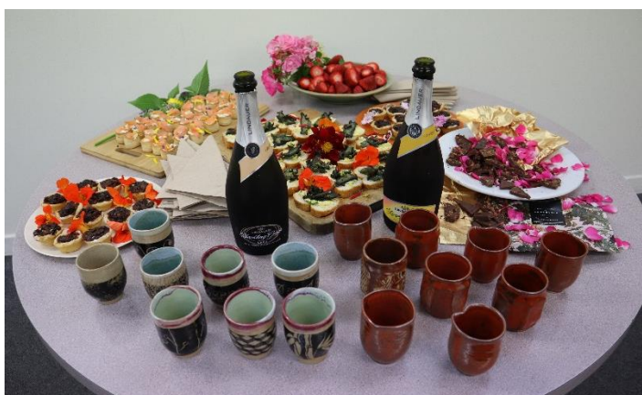
Beautiful kai for the 'Sponsors and Friends' event