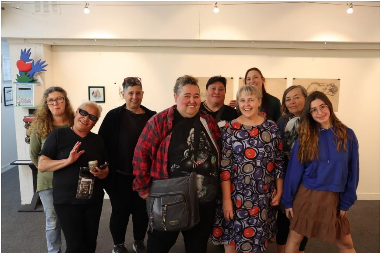
Participating artists celebrate the opening of the Women's Day Show