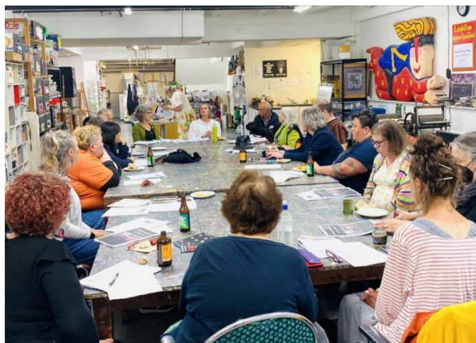
Participants at our Planning Day