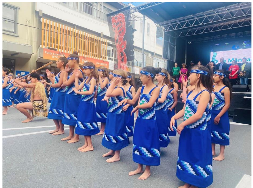
Our stall at the Newtown Festival, and kapa haka performers