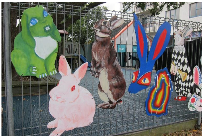
Rabbit decorations at the Newtown Festival

This year we celebrated the Lunar New Year (Year of the Rabbit). The Newtown Festival is where we display and sell our iconic plywood animals (rabbits) created by staff and decorated by staff and artists alike. We had a marvelous spot for our stall with lots of foot traffic. Our rabbits were proudly chattering on the fence behind us as we sold and displayed artists' work on our stall. It was a great opportunity to talk, dance and promote Vincents. There was much interest by the community and a great number of Vincents brochures were handed out. This is a great networking opportunity and thanks to all those that were involved. We managed to sell 39 out of 53 of our beautiful rabbits and enjoyed the very tasty kai that was on offer.